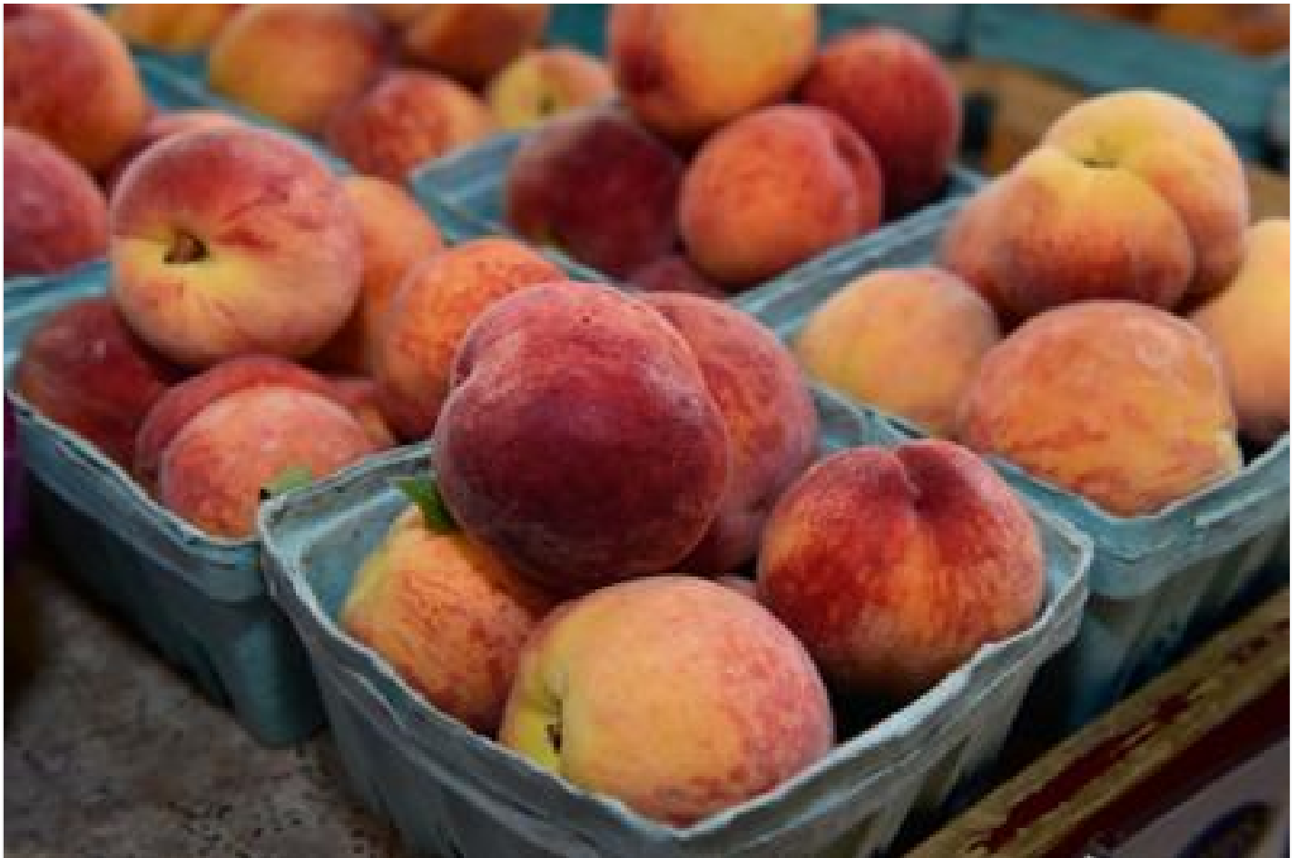
Peach season's here in Lancaster County, despite damage from hail and a bud-killing bitter cold snap