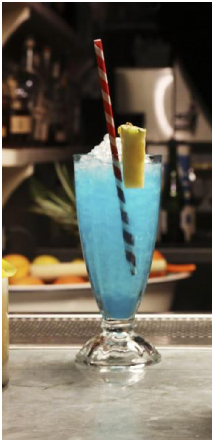
The Blue Hawaii cocktail, featuring Blue Curacao liqueur, at Pepe Le Moko in Portland, Ore.