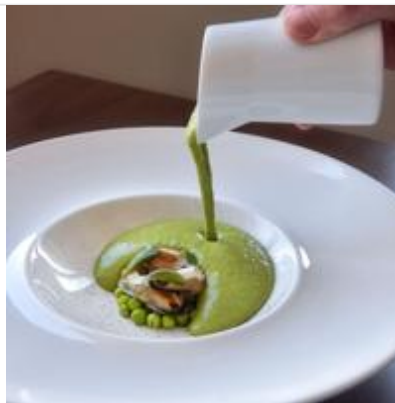
Green foods can be a healthy addition to your meals [tips and recipes]